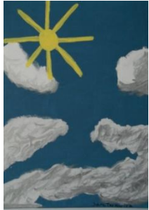
"Daytime in the Sky"