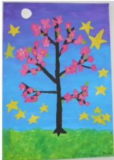
"No Trees on a Spring Day"