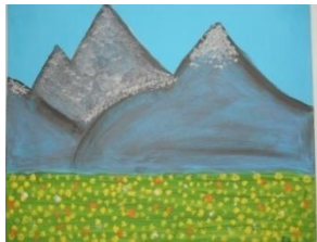
"Sound of Music"