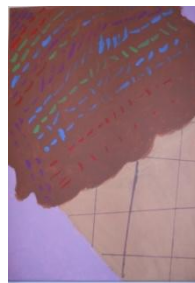
"Ice Cream Cone"