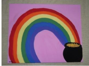
“Somewhere Over the Rainbow”